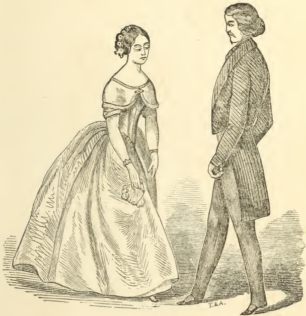
COTILLON CHANGE; FORWARD TWO.